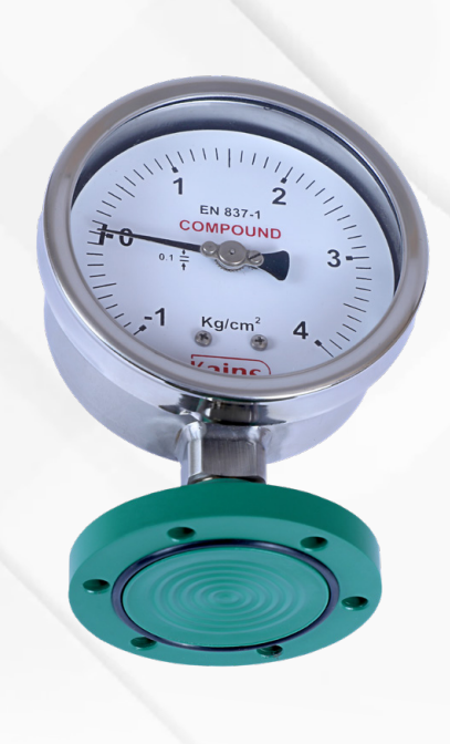
PTFE Coated Diaphragm