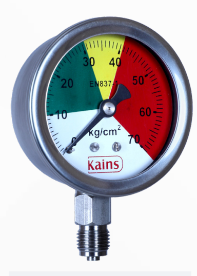
Customized Dial Gauge