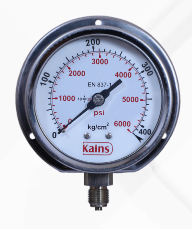
Bottom Surface Mounting