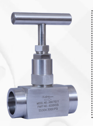
Socket Weld Needle Valve