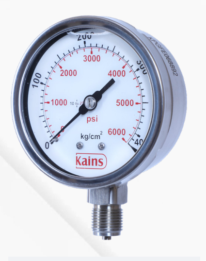
Glycerine Filled Pressure Gauge