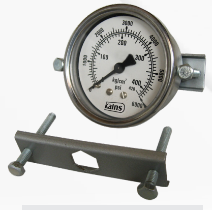
Back Bracket Mounting