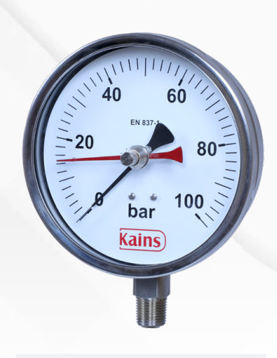
Pressure Gauge with Follower Pointer (MRP)