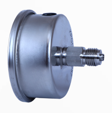
Back Direct Mounted Gauge