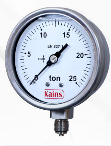
Load Pressure Gauge