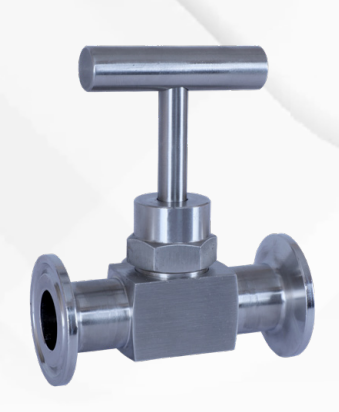
T C End Needle Valve