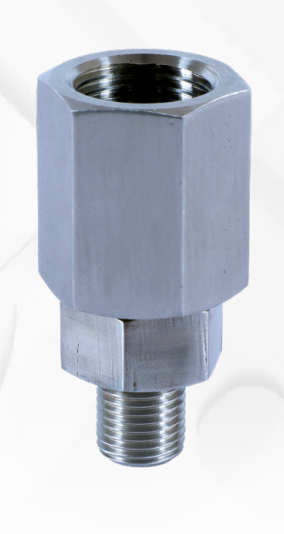
High Pressure Swivel Nut